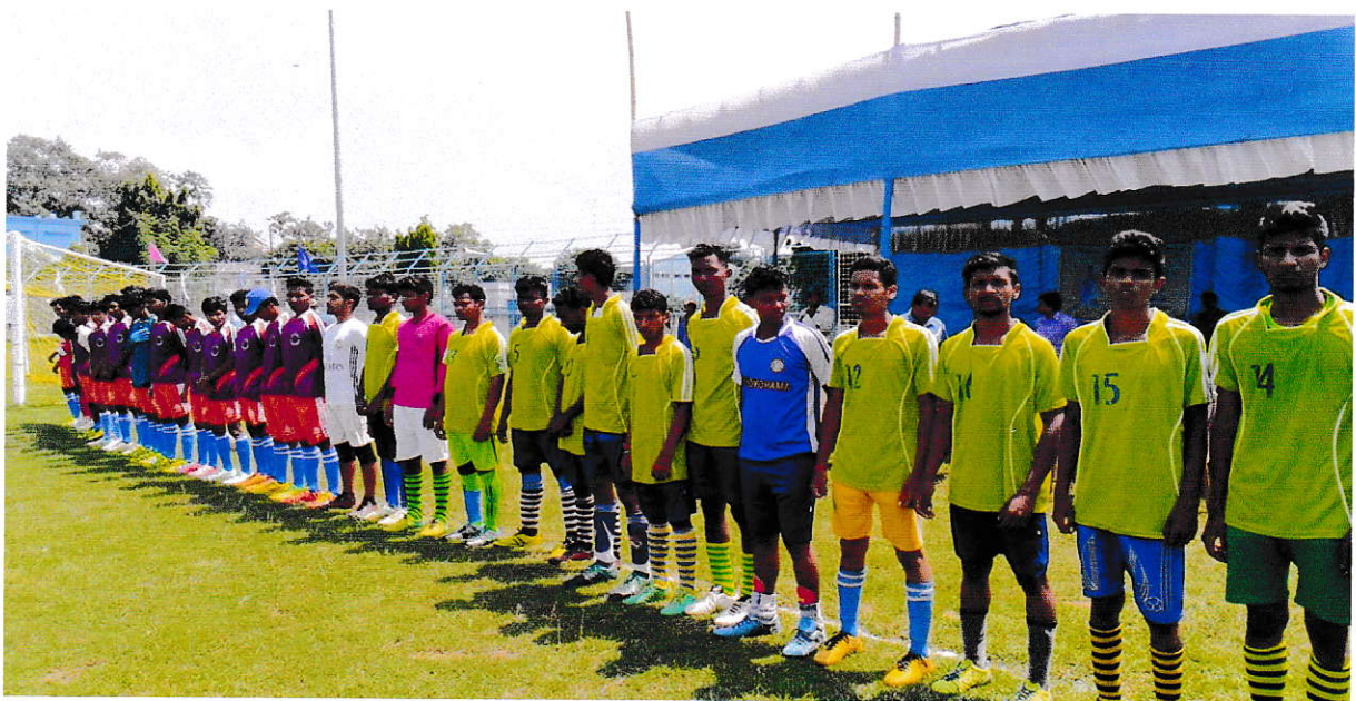
Inter college State Games and Sports championship 2018-19 (Football event)