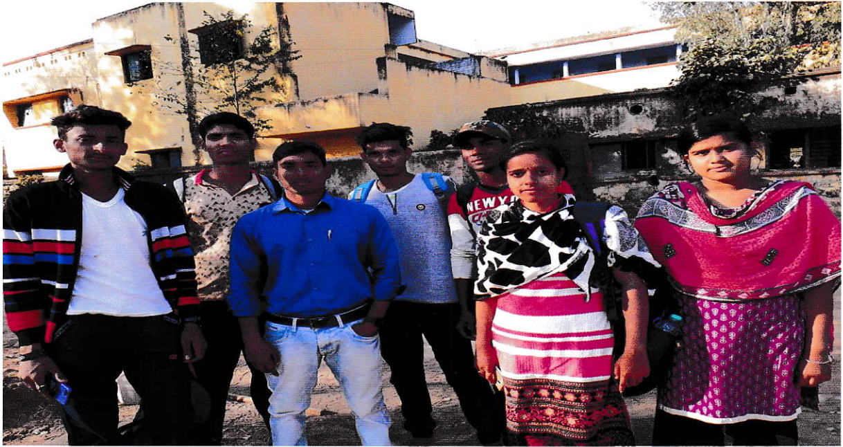
Inter college State Games and Sports championship 2018-19(Athletics)