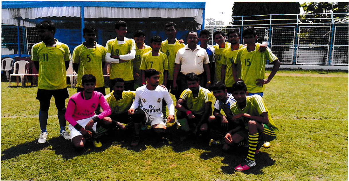
Inter college State Games and Sports championship 2018-19 (Football event)