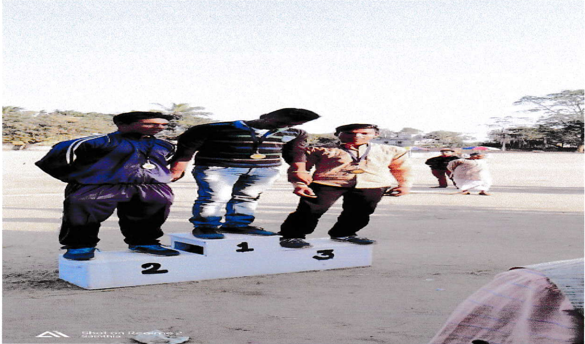
Inter college State Games and Sports championship 2018-19(Athletics)