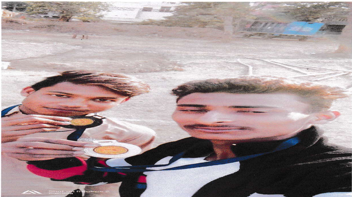
Inter college State Games and Sports championship 2018-19(Athletics)