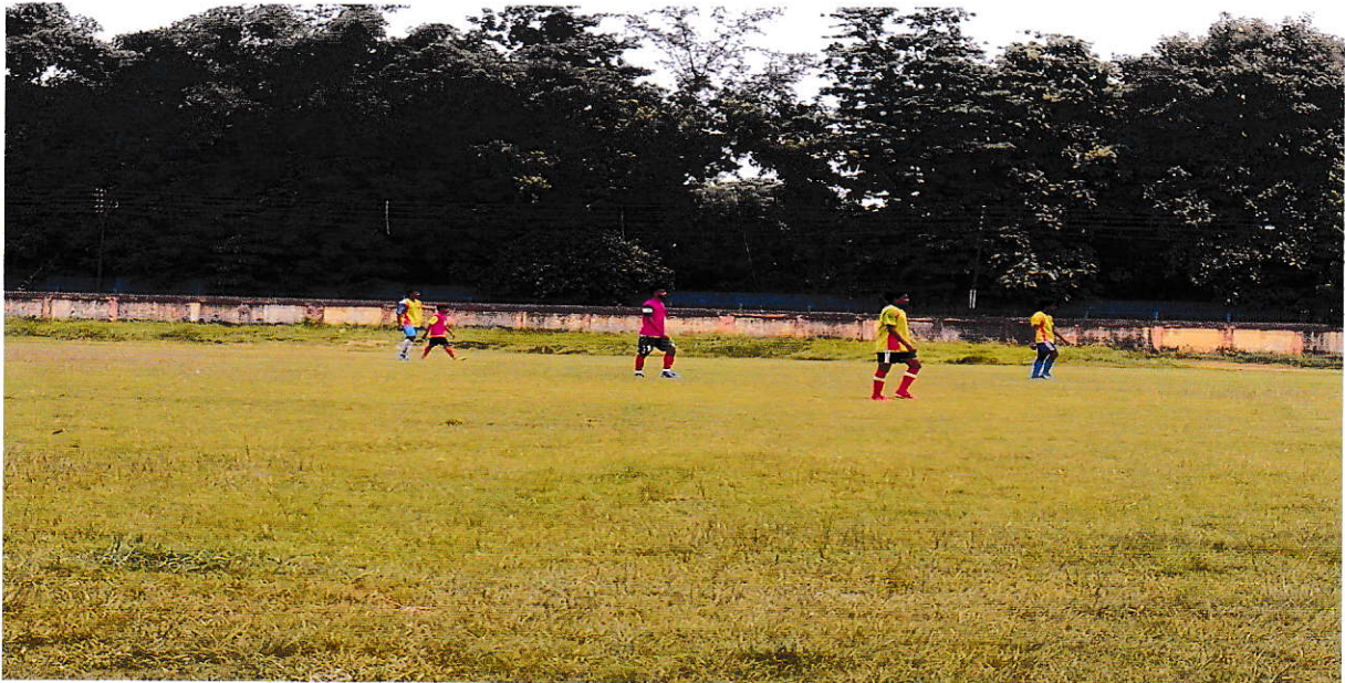
Burdwan University Football Team Selection Trial