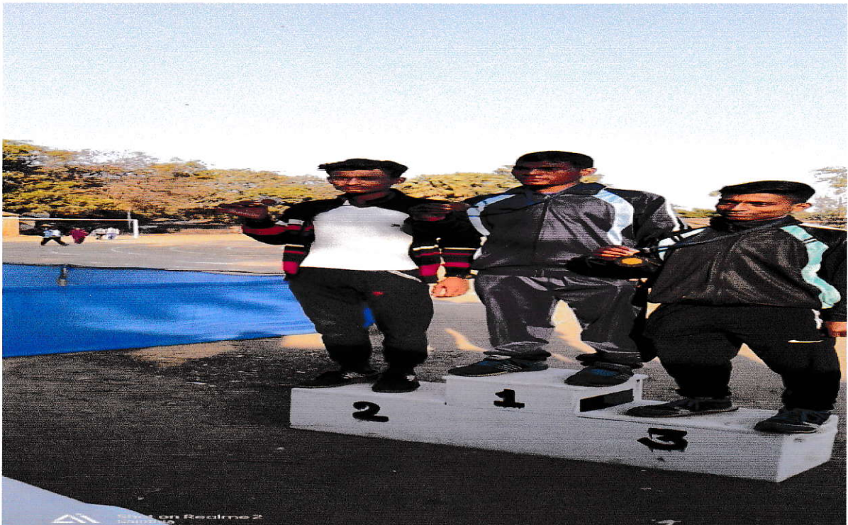
Inter college State Games and Sports championship 2018-19(Athletics)