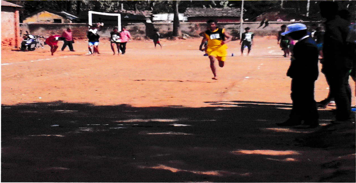
Inter college State Games and Sports championship 2018-19(Athletics)