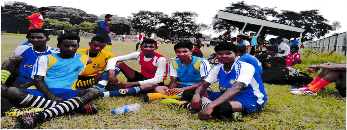
Burdwan University Football Team Selection Trial