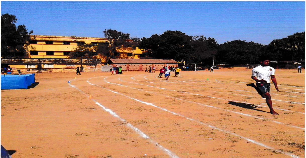
Inter college State Games and Sports championship 2018-19(Athletics)